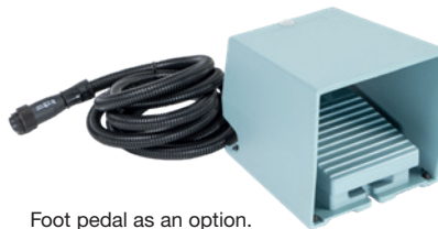
Foot pedal as an option.