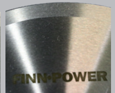
Smooth blade as an option.