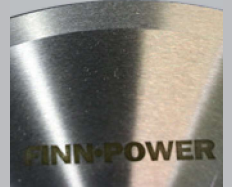
Smooth blade as an option.

FURTHER INFO ON OPTIONS, PLEASE REVERT TO SPECIFIC PRODUCT CARD